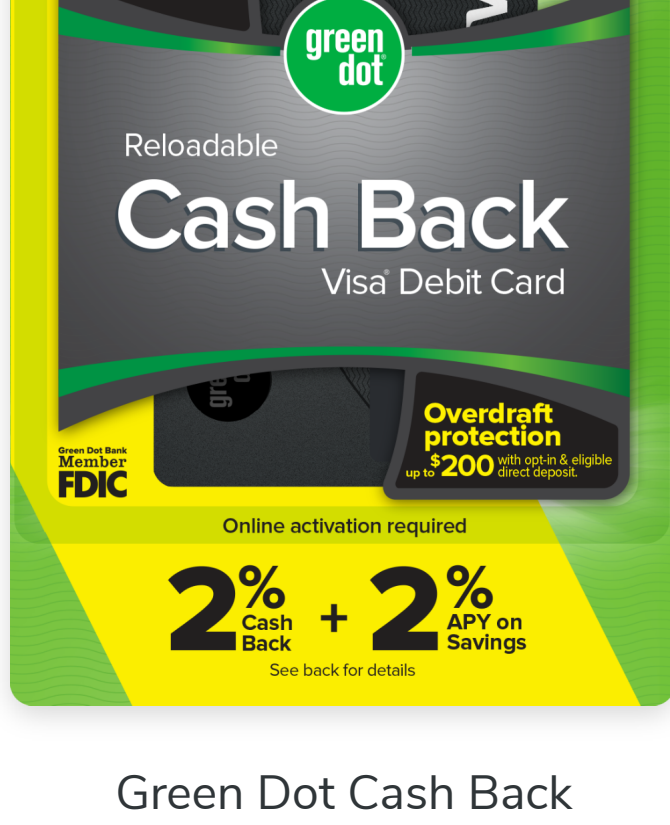
Green Dot Cash Back Visa® Debit Card

Earn 2% cash back on your online and mobile purchases plus earn 2% interest (APY) on savings. 3