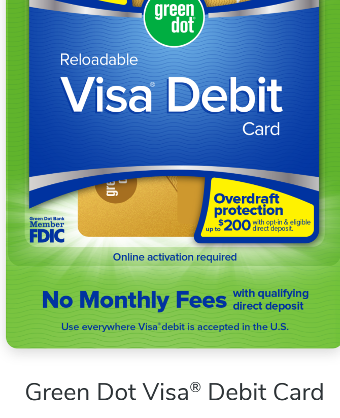
Green Dot Visa® Debit Card

Everyday banking with no monthly fees 1 that helps you budget and manage your money —anytime, anywhere you need it.