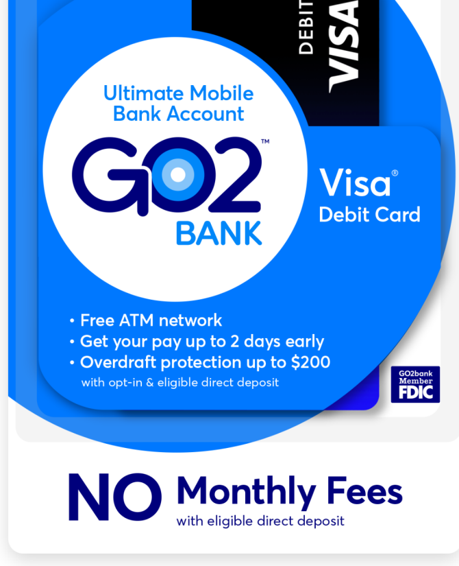
GO2bank Visa® Debit Card

No monthly fees, 4 overdraft protection 5 and free ATM network. 6 Plus, up to 7% cash back with eGift card purchases in the app 7 and 1% interest (APY) on your savings. 8