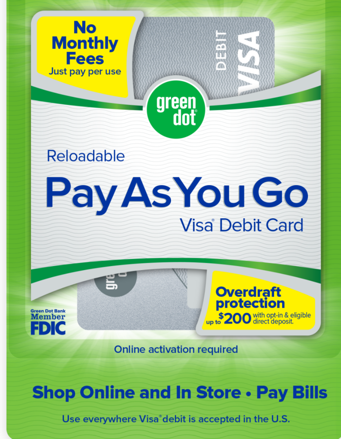
Green Dot Pay As You Go Visa® Debit Card