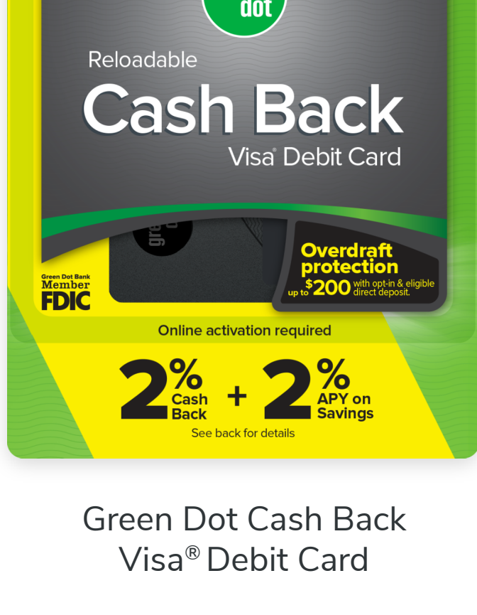
Green Dot Cash Back Visa® Debit Card